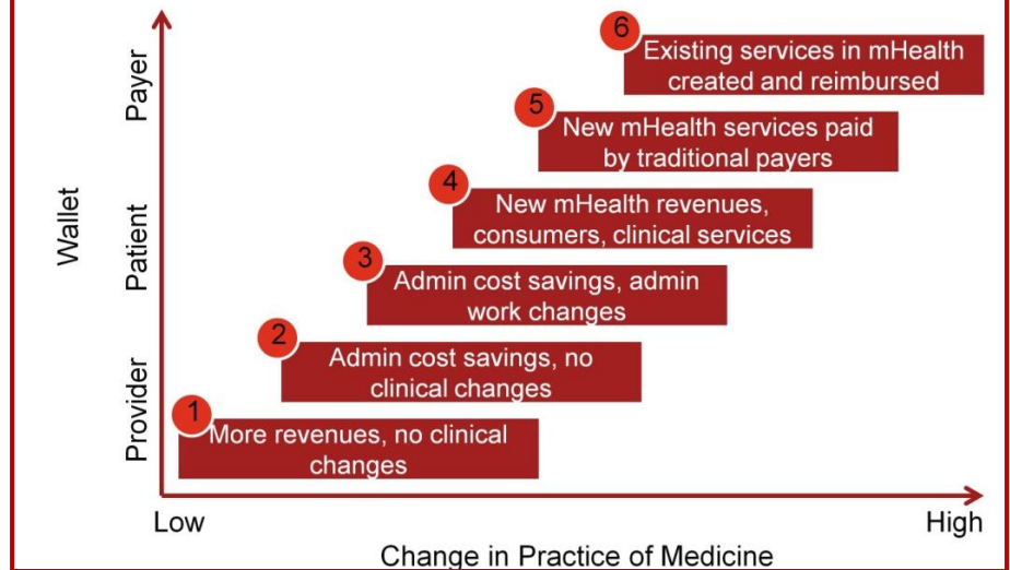
Figure 1: Medical models evolve as providers and payers gradually become familiar with mHealth solutions for everyday tasks

which are not being addressed by traditional applications. Revenue is generated by filling a gap that is not being currently satisfied by traditional vendors. For example, some companies specialise in preventative medicine by offering digital tools that integrate genetics, metabolic and traditional medicine for a personalised diet and exercise regimen.